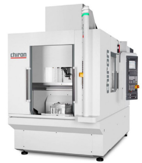
Shown with workchanger