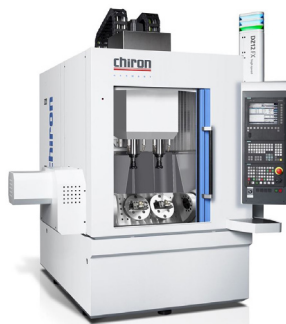
5-axis shown with dual spindles